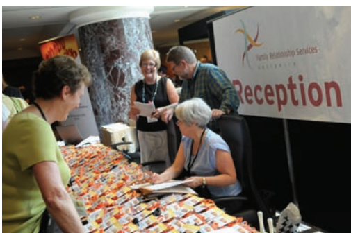
FRSA Registration Desk