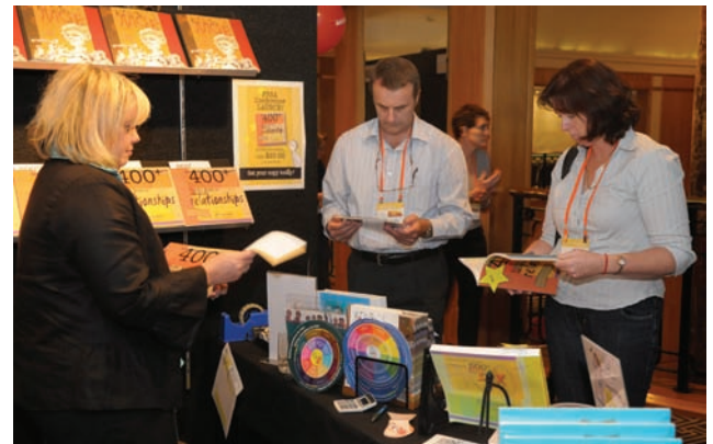
The above are examples of some of the conference exhibition booths