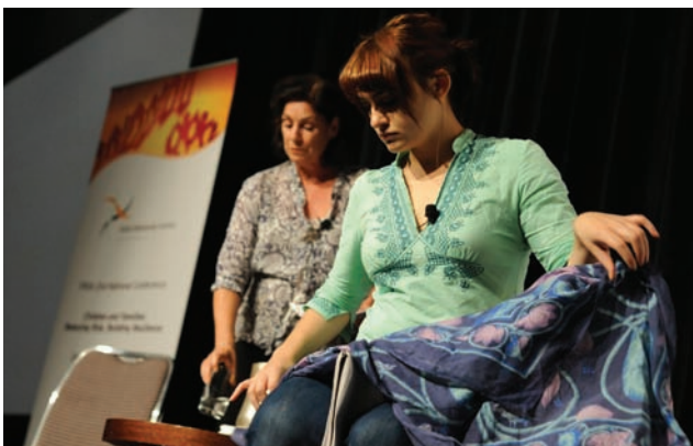
Alex Buzo Company perform Shafana and Aunt Sarrinah