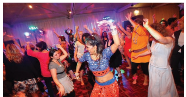
Dance Central Bollywood Dancers