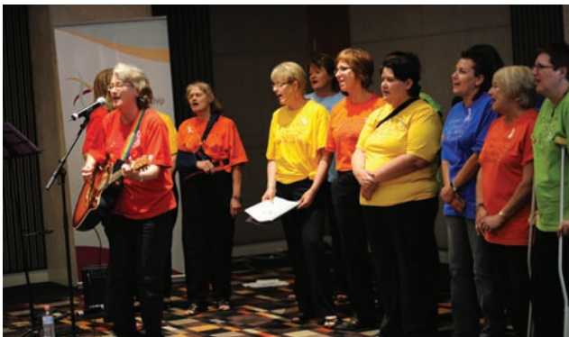
Choir of No More Knocks

Both performances were rated highly in evaluation feedback, with delegates commenting that it provided an opportunity for reflection and brought a human aspect to the conference.